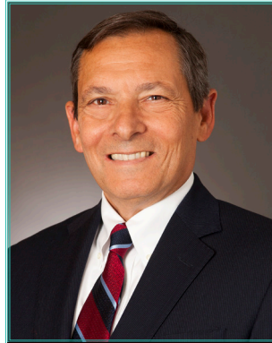
Joseph Basile Foley Hoag LLP